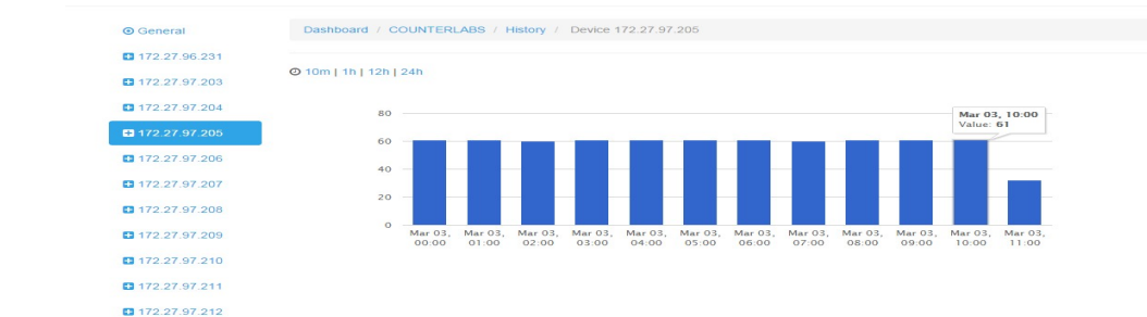
Figure 5. Web graph visualization of performed mechanical cycles (x100) for 12 hour – displayed for one electronic counter IP module